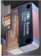
Light Scanner PNP Cat No: 0009.095 Part No: 10075539