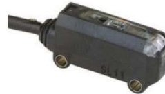
Light Scanner B24 KPL Cat No: Part No: 10247385