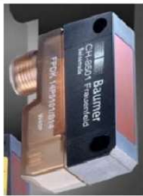
Light Scanner PNP Cat No: 0009.095 Part No: 10075539