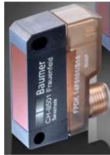
Light Barrier PNP 30vdc 6.0M Cat No: 110.017 Part No: 10058060