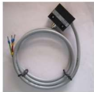
Limit Switch SM10T17S 1U I3500 Cat No: Part No: 143564