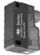
Light Transmitter PN/NP 12M Cat No: 0005.066 Part No: 10075538