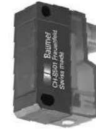
Light Transmitter PN/NP 24 vdc Cat No: 0005.066 Part No: 0920-5964