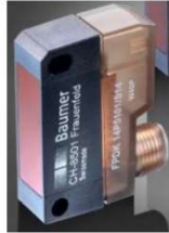
Light Barrier PNP 24VDC 2.5 M Cat No: 0014.043 Part No: 0920-5963