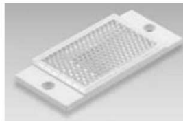
Reflector VR10 Cat No: Part No: 155449