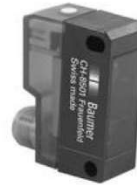
Light Receiver PNP 24VDC Cat No: 0005.065 Part No: 0920-5951