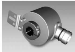
Incremental Shaft Encoder 10-30vdc 200 Cat No: Part No: 10236973