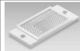
Reflector 40X18 Cat No: Part No: 10164914