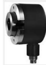
Pulse Generator 88IMP m.bohrig.D10 B91 Cat No: B91 Part No: 170511