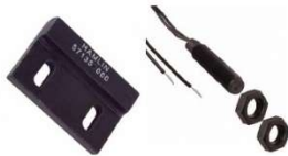
Magnet Reed Sensor Cat No: 0004.022 Part No: 0011-1637