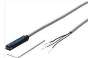
Magnetic Field Sensor S22 kpl. Cat No: Part No: 10390973