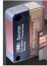
Reflecting Light Barrier PNP 24VDC 0,7M Cat No: Part No: 10164913