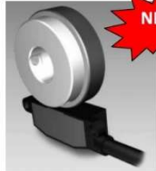
Pulse Generator 2000IMP.HOHLWELLE Cat No: B92 Part No: 167737