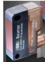
Light Barrier Cat No: 110.017 Part No: 10109985