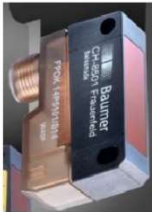
Light Scanner PNP 30VDC 0,35M Cat No: Part No: 10075550