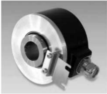
Pulse Generator 2000IMP.HOHLWELLE Cat No: B92 Part No: 167737