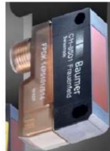
Light Scanner PNP 30VDC 0,35M Cat No: 690.019 Part No: 10075550