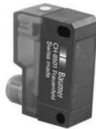
Light Barrier AC/DC24 500MM Cat No: Part No: 155500