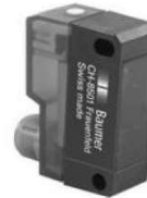
Sensor Cat No: Part No: 10087847