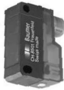
Light Transmitter PN/NP 12M Cat No: 0005.066 Part No: 10075538